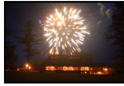
Fireworks light up camp!

While it was great to see all of the faces from the past, the celebration was only the beginning. After the alumni and Micah in Israel campers left, we had a giant birthday party for the current