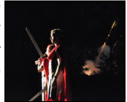
Color War Break 2010

and enjoyed a delicious ice cream sundae bar for dessert. Following dinner and the birthday party, we were treated to a professional fireworks display. The display was really amazing and it was evident that everyone sensed something else may happen...you guessed it, we broke COLOR WAR!