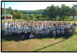
Camp Northbound 2010