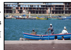
River in Rabat