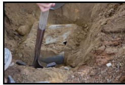
Digging up the time capsule from the first summer of camp

to camp, they had the chance to see the changes we've made over the years, catch up with old friends and remember all of the good times they had on the shores of Peabody Pond. The celebration started as we gathered in the chapel to dig up the time capsule from the first summer of camp and to bury the new one, which will hopefully be in a bit better shape when we dig it up years from now. Alumni were then welcomed to a lunch under the tent followed by time spent at the pool, lake and various other activity areas.