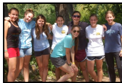
Micah in Israel campers and staff reunite with old friends and counselors.

went you would hear phrases like, "remember when we..." or "I can't believe how big they are!" Those who say, "you can never go home again," have obviously never been part of the Camp Micah family.