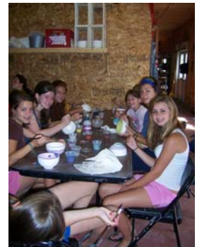
Hard at work on the soup bowls