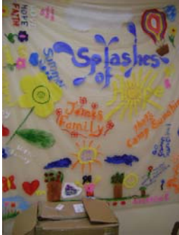
A Family Art Project at Camp Sunshine