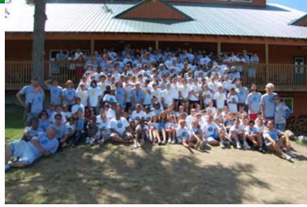
The Northbound Crew