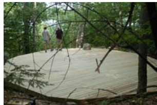
The Ladder Site

An exciting new program called the ladder replaced the outpost this summer. Based on the story, Jacob's Ladder, it is an overnight program designed to challenge campers and teach them how to work as a team. For completion of certain tasks bunks were able to earn a rung on the ladder. Although the rain made it difficult the program made great strides and those who participated really learned about themselves and their bunkmates. We look forward to growing the program even more next summer.