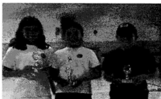
Individual winners, ages 12 & under

July 5's camp competition wasn't about sports skill, sailing expertise or tennis. It was about WORDS. 146 campers from 14 camps competed in the 3rd Annual MYCA Spelling Bee. Arcadia, Fernwood, Forest Acres/Indian Acres, Hidden Valley, Maine Golf & Tennis, Mataponi, Micah, Omni, Skylemar, Tapawingo, Tripp Lake, Walden, West End House, and Wigwam were represented. Children competed in two divisions, ages 12 and under and ages 13 and over.