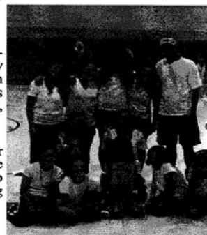
Winning Team, Camp Fernwood

Congratulations to all of the campers who participated. You did a great job!